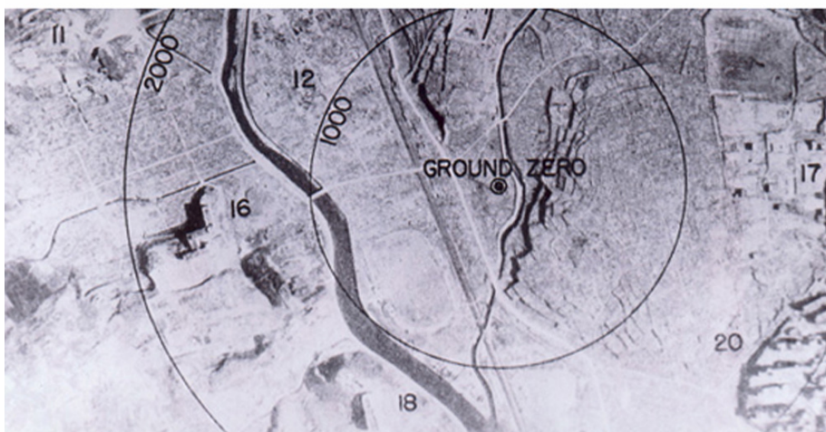
Nagasaki: Before and after the atom bomb